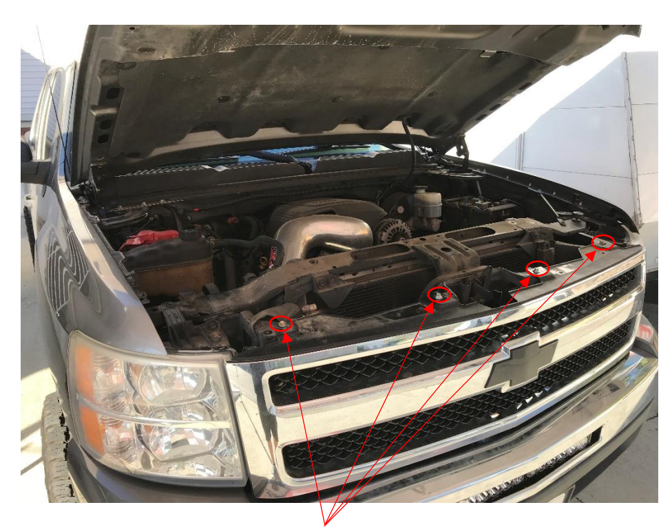
10mm Hex Head Grill bolts

1. Begin by opening the hood and locating the four hex head bolts along the top of the grill with the 10mm socket. Remove bolts and set aside.